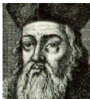
PLATE 9A. PORTRAIT OF EDWARD KELLEY