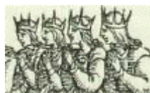
PLATE 4.B. SYMBOLICAL ILLUSTRATION Representing the Transmutation of the Metals

It must be borne in mind, however, that the alchemists used the terms "putrefaction" and "decay" rather indiscriminately, applying them to chemical