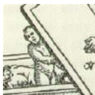
PLATE 4.A. SYMBOLICAL ILLUSTRATION Representing the Coction of Gold Amalgam in a Closed Vessel

possible with the mortification of the body; and all true Mysticism teaches that if we would reach the highest goal possible for man -- union with the Divine -- there must be a giving up of our own individual wills, an abasement of the soul before the Spirit. And so the alchemists taught that for the achievement of the magnum opus on the physical plane, we must strip the metals of their outward properties in order to develop the essence within. As says Helvetius: ". . . the essences of metals are hidden in their outward bodies, as the kernel is hidden in the nut. Every earthly body, whether animal, vegetable, or mineral, is the habitation and terrestrial abode of that celestial spirit, or influence, which is its principle of life or growth. The secret of Alchemy is the destruction of the body, which enables the Artist to get at, and utilise for his own purposes, the living soul." 17 This killing of the outward nature of material things was to be brought about by the processes of putrefaction and decay; hence the reason why such processes figure so largely in alchemistic recipes for the preparation of the "Divine Magistery."