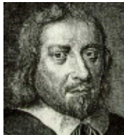
PLATE 11. PORTRAIT OF JACOB BOEHME

Jacob Boehme , or Behmen (see plate 11), was born at Alt Seidenberg, a village near Görlitz, in 1575. His parents being poor, the education he received was of a very rudimentary nature, and when his schooling days were over, Jacob was apprenticed to a shoemaker. His religious nature caused him often to admonish his fellow-apprentices, which behaviour ultimately caused him to be dismissed. He travelled about as a journeyman shoemaker, returning, however, to Görlitz in 1594, where he married and settled in business. He claims to have experienced a wonderful vision in 1598, and to have had a similar vision two years later. In these visions, the first of which lasted for several days, he believed that he saw into the inmost secrets of nature; but what at first appeared dim and vague became clear and coherent in a third vision, which he tells us was vouchsafed to him in 1610. It was then that he wrote his first book, the Aurora , which he composed for himself only, in order that he should not forget the mysteries disclosed to him. At a later period he produced a large number of treatises of a mystical-religious nature, having spent the intervening years in improving his early education. These books aroused the ire of the narrow-minded ecclesiastical authorities of the town, and Jacob suffered considerable persecution in consequence. He visited Dresden in 1694, and in the same year was there taken ill with a fever. Returning to Görlitz, he expired in a condition of ecstasy.