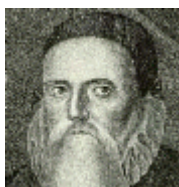
PLATE 9B. PORTRAIT OF JOHN DEE