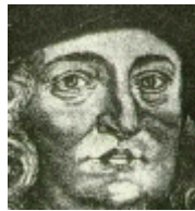
PLATE I. PORTRAIT OF PARACELSUS