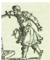
PLATE 3.B. SYMBOLICAL ILLUSTRATION Representing the Amalgamation of Gold with Mercury (See page 33.)