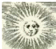
PLATE 3.A. SYMBOLICAL ILLUSTRATION Representing the Fertility of the Earth