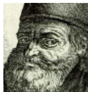
PLATE 8B. PORTRAIT OF NICOLAS FLAMEL