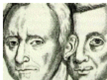
PLATE 12. PORTRAITS OF J.B. AND F.M. VON HELMONT (From the Frontispiece to J.B. van Helmont's Oriatrike ).

Van Helmont regarded water as the primary element out of which all things are produced. He denied that fire was an element or anything material at all, and he did not accept the sulphur-mercury-salt theory. To him is due the word "gas" -- before his time various gases were looked upon as mere varieties of air -- and he also made a distinction between gases (which could not be condensed) 18 and vapours (which give liquids on cooling). In particular he investigated the gas that is now known as carbon-dioxide (carbonic anhydride), which he termed gas sylvestre ; but he lacked suitable apparatus for the