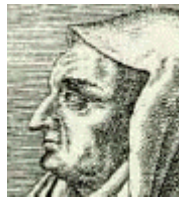
PLATE 7. PORTRAIT OF ALBERTUS MAGNUS. [by de Bry]

The celebrated Dominican, Thomas Aquinas (see plate 8), was probably a pupil of Thomas Albertus Magnus, from whom it is thought he imbibed alchemistic learning. It is very probable, however, that the alchemistic works attributed to him are spurious. The