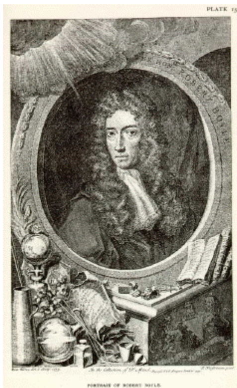
PLATE 15. PORTRAIT OF ROBERT BOYLE