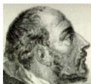
PLATE 8A. PORTRAIT OF THOMAS AQUINAS