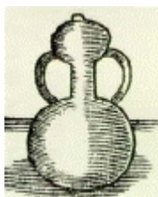
PLATE 6. ALCHEMISTIC APPARATUS: A. -- An Athanor. B. -- A Pelican

still-head which can be luted on to a flask or other vessel, and was much used for distillations. In the present case, however, the alembics are employed in conjunction with apparatus for subliming difficultly volatile substances. Plate 5, fig. B, shows another apparatus for sublimation, consisting of a sort of oven, and three detachable upper chambers, generally called aludels. In both forms of apparatus the vapours are cooled in the upper part of the vessel, and the substance is deposited in the solid form, being thereby purified from less volatile impurities. Plate 6, fig. A, shows an athanor (or digesting furnace) and a couple of digesting vessels. A vessel of this sort was employed for heating bodies in a closed space, the top being sealed up when the substances to be operated upon had been put inside, and the vessel heated in ashes in an athanor, a uniform temperature being maintained. The pelican, illustrated in plate 6, fig. B, was used for a similar purpose, the two arms being added in the idea that the vapours would be circulated thereby.