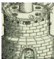
PLATE 5. ALCHEMISTIC APPARATUS A and B. -- Two forms of the apparatus for Sublimation

We will conclude this chapter with some few remarks regarding the practical methods of the alchemists. In their experiments, the alchemists worked with very large quantities of material compared with what is employed in chemical researches at the present day. They had great belief in the efficacy of time to effect a desired change in their substances, and they were wont to repeat the same operation (such as distillation, for example) on the same material over and over again; which demonstrated their unwearied patience, even if it effected little towards the attainment of their end. They paid much attention to any changes of colour they observed in their experiments, and many descriptions of supposed methods to achieve the magnum opus contain detailed directions as to the various changes of colour which must be obtained in the material operated upon if a successful issue to the experiment is desired. 20